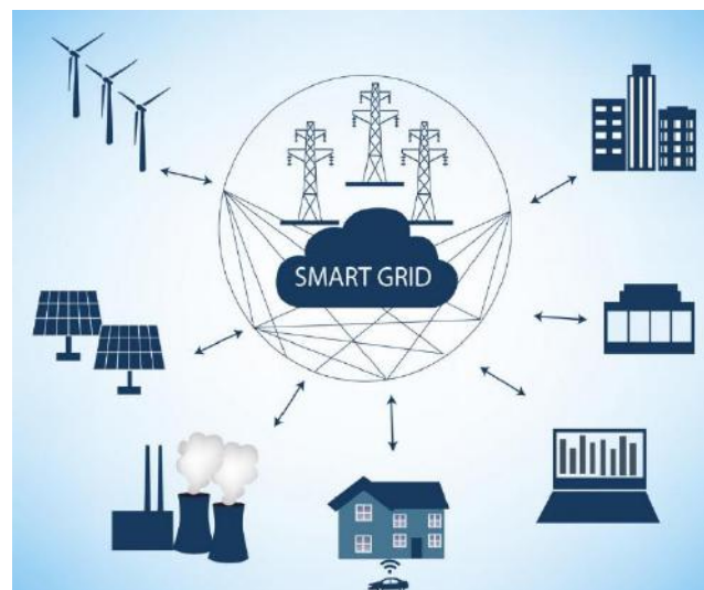
Fig.3 Balancing Feedback Loop

Bringing the customers further and further into energy loop is also an important assert of smart grid that requires more analysis.