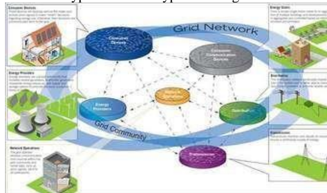
Fig 1: A View of Grid connected to System of Networks

microgrid. Microgrid Energy Management System (MG-EMS) prototype which incorporates many software applications that can manage the sensing data and can perform load and generation management. In order to extend the microgrid from one fledge of grid to a full fledge smart grid, the HEMS, BEMS, renewable energy resources typically PV and BESS can be integrated from one type to another type micro grid.